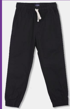
Black shorts/plain black jogging bottoms