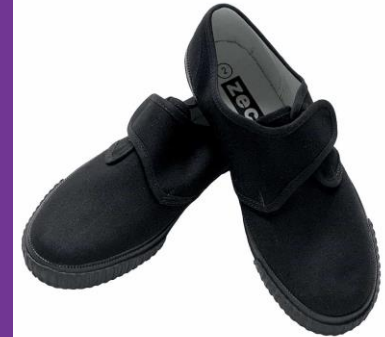
Plimsolls or trainers

White Ear piercings must be taken out or taped over during PE lessons.